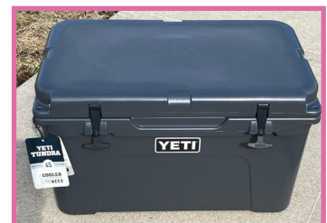
YETI Cooler Donated By: Tractor Supply Co. Washington C.H., Ohio • 740-335-0651